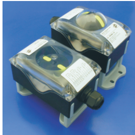
Model EPP (S. 1)