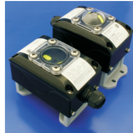
Model EAP (S. 5)