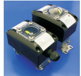
Model EAE (S. 6)