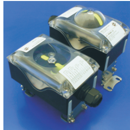
Model EPE (S. 2)