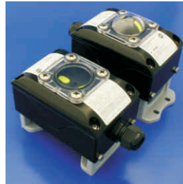
Model EAP (S. 5)