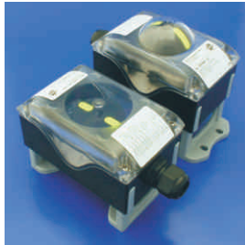
Model EPP (S. 1)