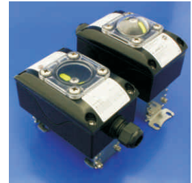
Model EAE (S. 6)