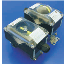
Model EPE (S. 2)